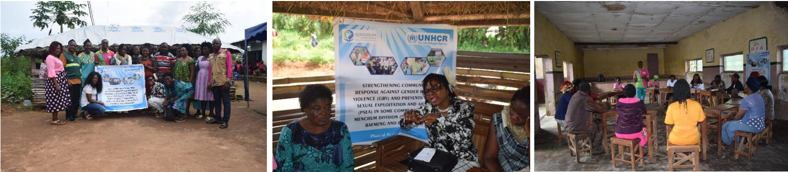
Training of Health Workers in Wum and Bafmeng

BIHAPH staff in the course of the project had 3 training courses from UNHCR, 1 induction meeting and 2 trainings on the use of the kobocollect tool to collect data for cash assistance for shelter and protection.