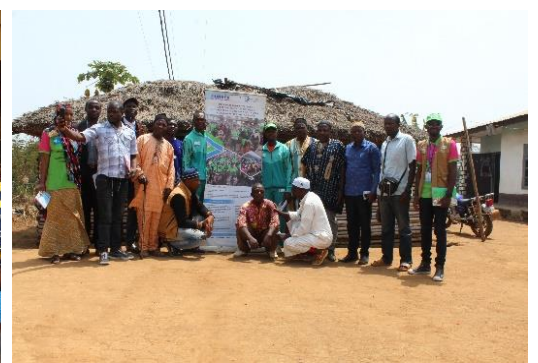
GBV Champions in Wum and Bafmeng