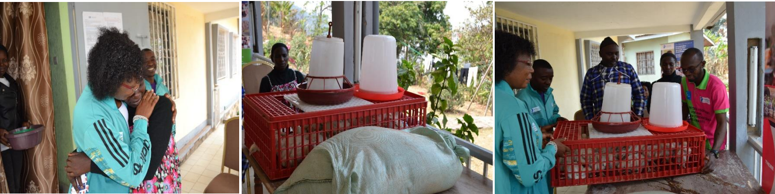
Donation to the referee