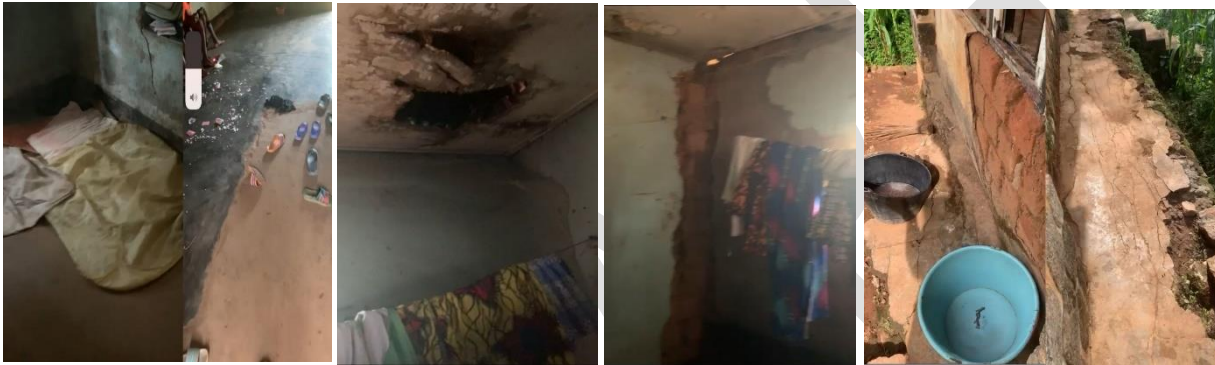
Picture of house taken during needs assessment