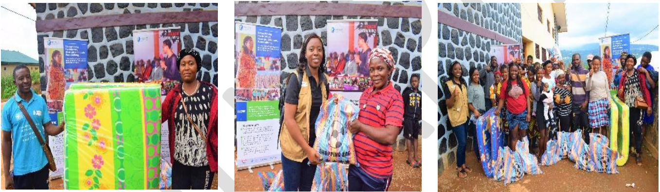
Happy IDPs receive relief items from BIHAPH staff

These families expressed profound gratitude to BIHAPH and partners for the relief which they say will go a long way to improve on their current state of being.