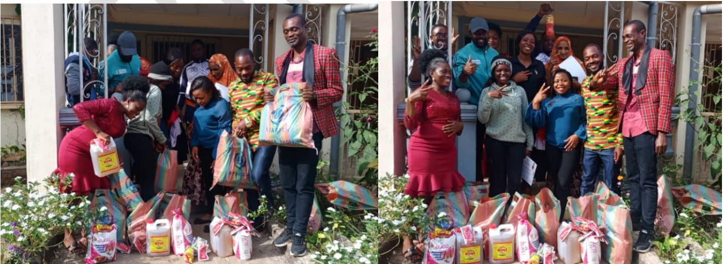
BIHAPH celebrates Christmas with Staff