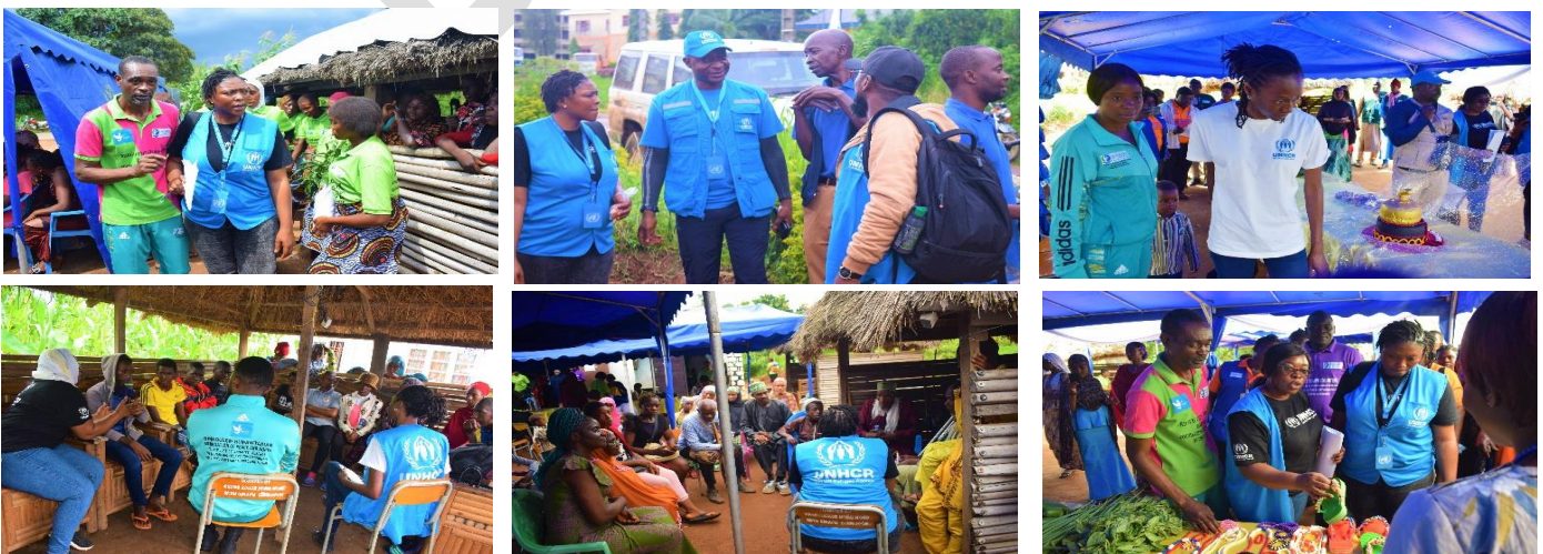
UN Multifunctional team visit to Wum