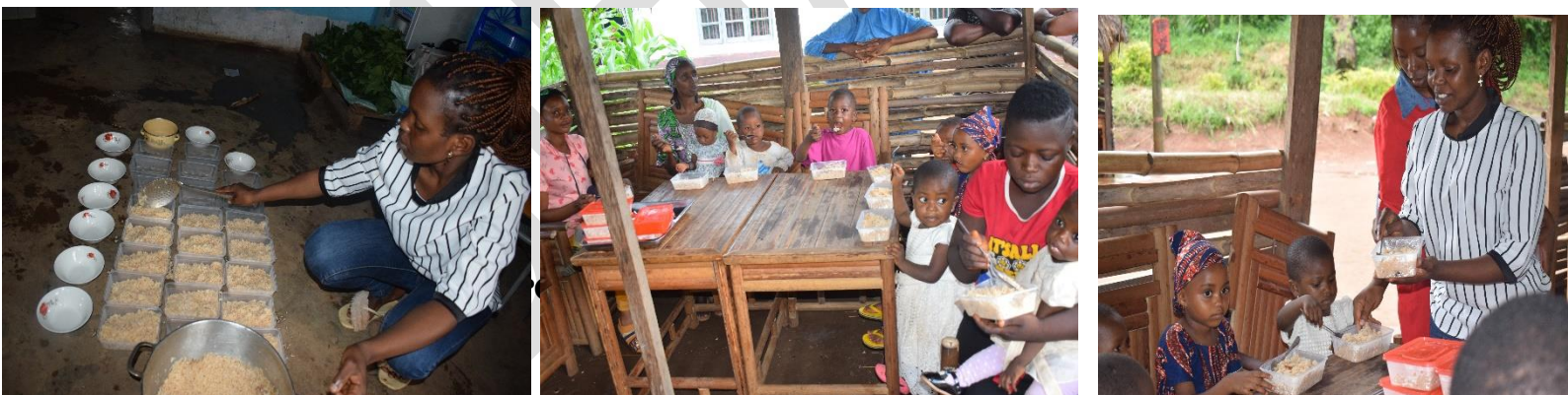
BIHAPH Feeding needy children

BIHAPH through her feeding scheme continued to feed needy children in Wum with over 12 children benefitting in the first half of the year. BIHAPH also did hospital visitations and made home supplies for some GBV survivors in Wum.