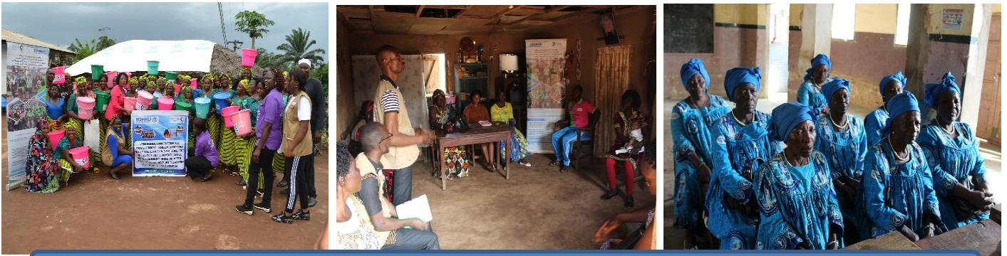
Some Social and Cultural Groups in Wum and Bafmeng with changed constitutions