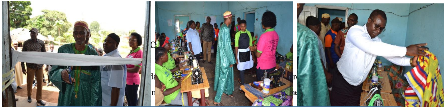
Inauguration of BIHEC