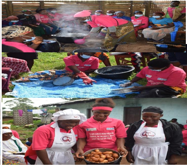
SPECIAL TRAINING IN WUM AND BAFMENG