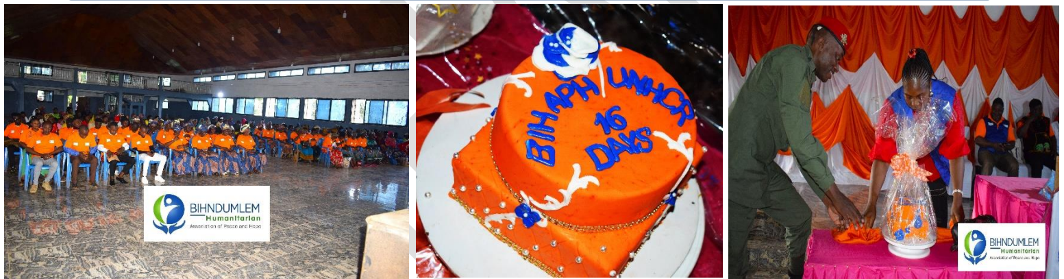
16 Days Activism in Wum and Bafmeng