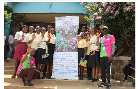
Gender Clubs in Wum and Bafmeng