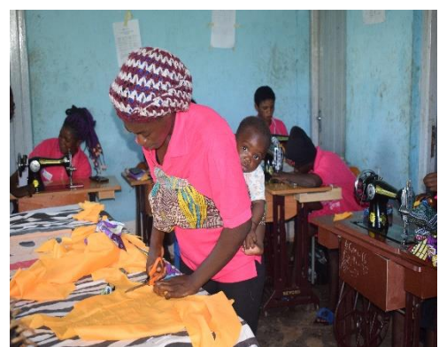
Vocational Training in Wum and Bafmeng