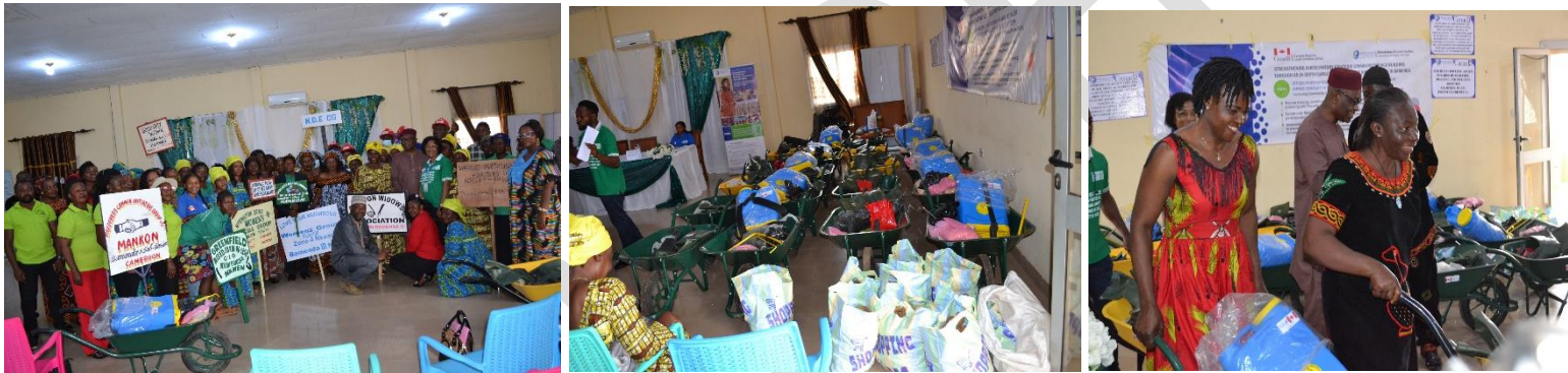
Distribution of farm kits and seeds to CIGs in Bamenda I, II and III

The second phase of the project kicked off in the second half of the year with the highlight being the trauma healing workshop organised for community leaders in Bamenda I, II and III. For three days, these leaders received healing from the traumatic experiences of the crisis in the North West and South West Regions of Cameroon. They were also trained to be healers in their various communities. One of the highlights of the training was the first hand testimony from survivors of the insurgences in Babanki. These women from Babanki went home healed, happier and refreshed after their traumatic experiences were countered by professional trauma healing techniques by facilitators.