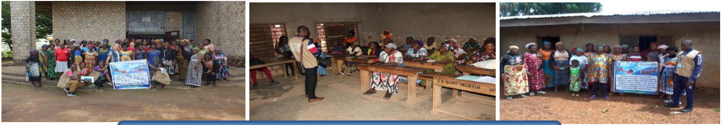
Sensitisation in Wum and Bafmeng