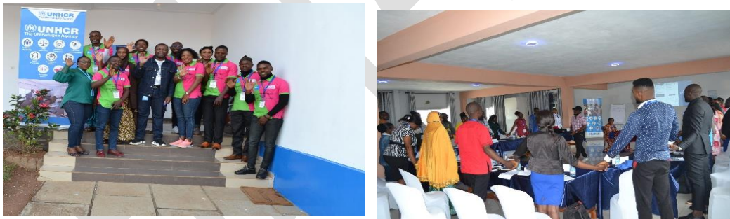
Capacity Building Workshops with UNHCR

At the end of the third phase of the project, BIHAPH received a multifunctional team from the United Nations. The team from the UN had a two-day evaluation and needs assessment with members of the community and left satisfied.