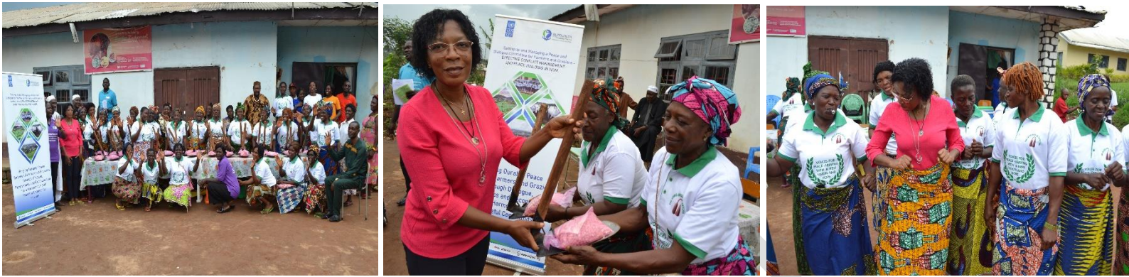
Ketcha Women receive farm kits and seeds from BIHAPH CEO