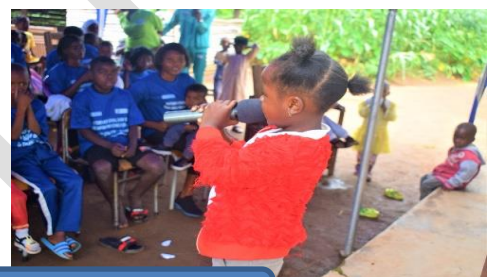
Celebration of the Day of African Child in Wum