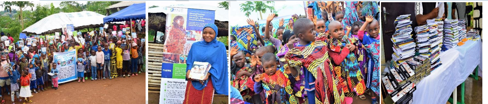
Back to school Campaign 2023