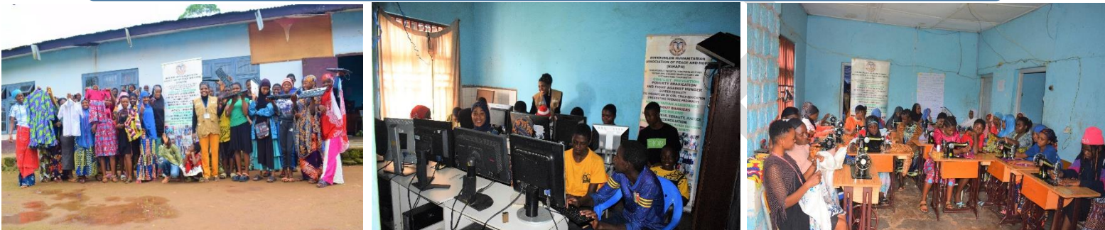
Trainees at BIHEC