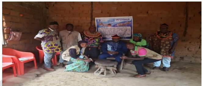
FGD with Fons, Queen Mothers and Notables in Wum and Bafmeng