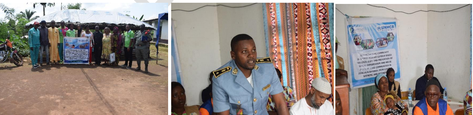
Conference Case Management