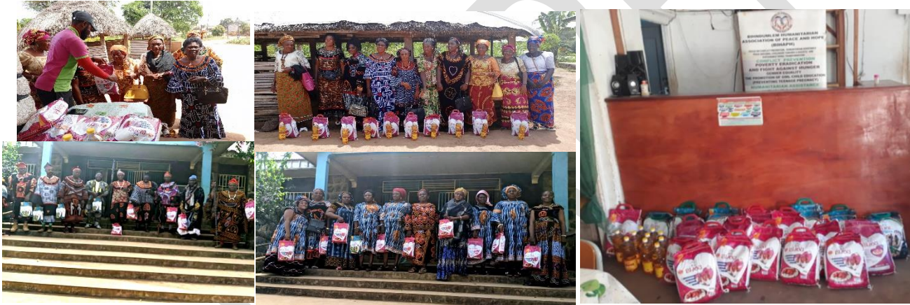
BIHAPH celebrating Christmas with Queen Mothers and Traditional Rulers