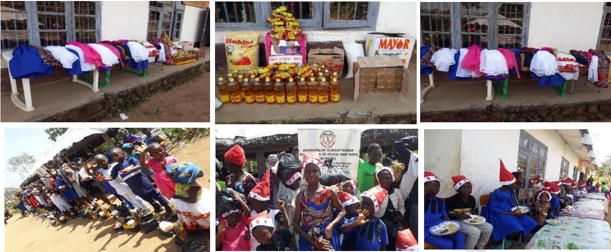
BIHAPH Celebrating Christmas with Vulnerable Children