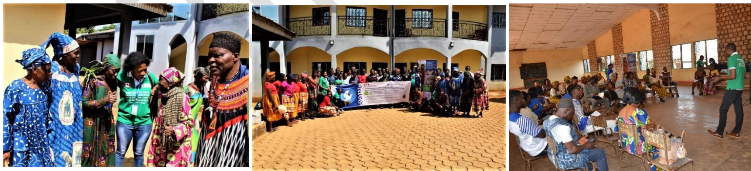
Community mobilisation and needs assessment in Bamenda I, II and III