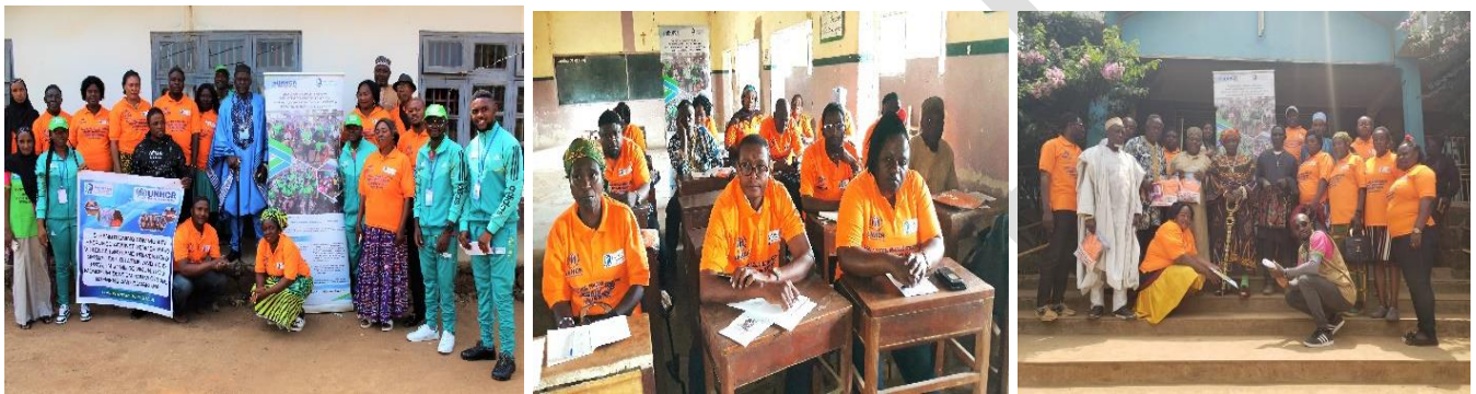
LDS members in Wum and Bafmeng